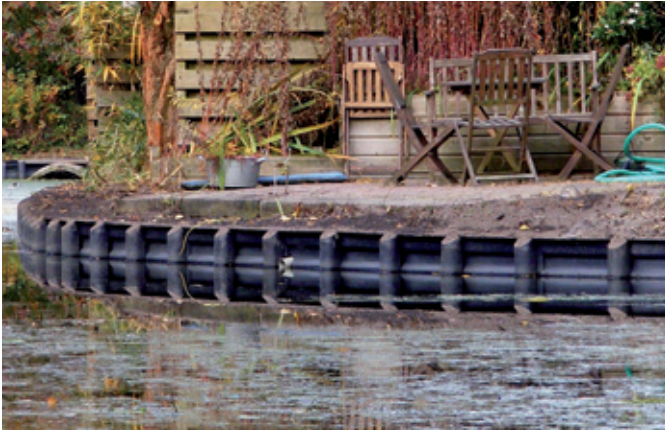
ROwat plastic sheet piling