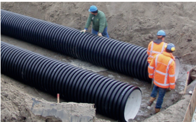
RObu PE pipe systems