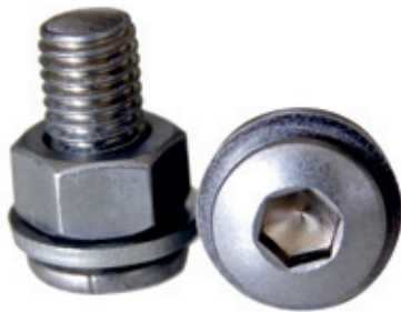
M12 bolts protected by Zinc-nickel

Since 2012 BCT has the CO 2 certificate. It means that BCT reduces the CO 2 emissions in every possible way.