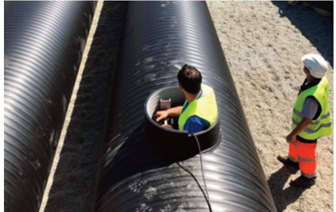
RObu Weholite PE tanks for underground water storage