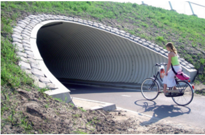
Multi-plate corrugated steel pipes and tunnels