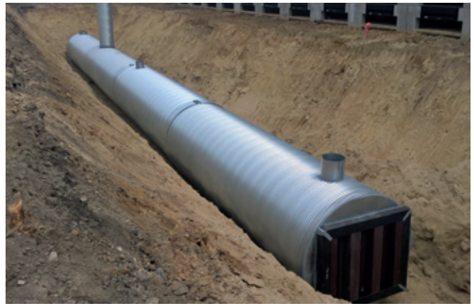
SPIROsol steel tanks for underground water storage